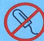
Feminine hygiene products