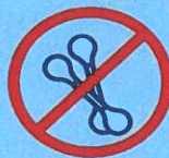
Cotton (Cotton swabs or balls)