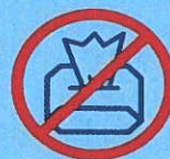
Wipes (Baby or flushable)